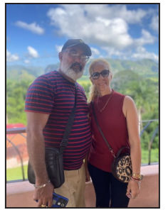
Edge pics are our leadership team