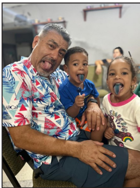
Love Love Love